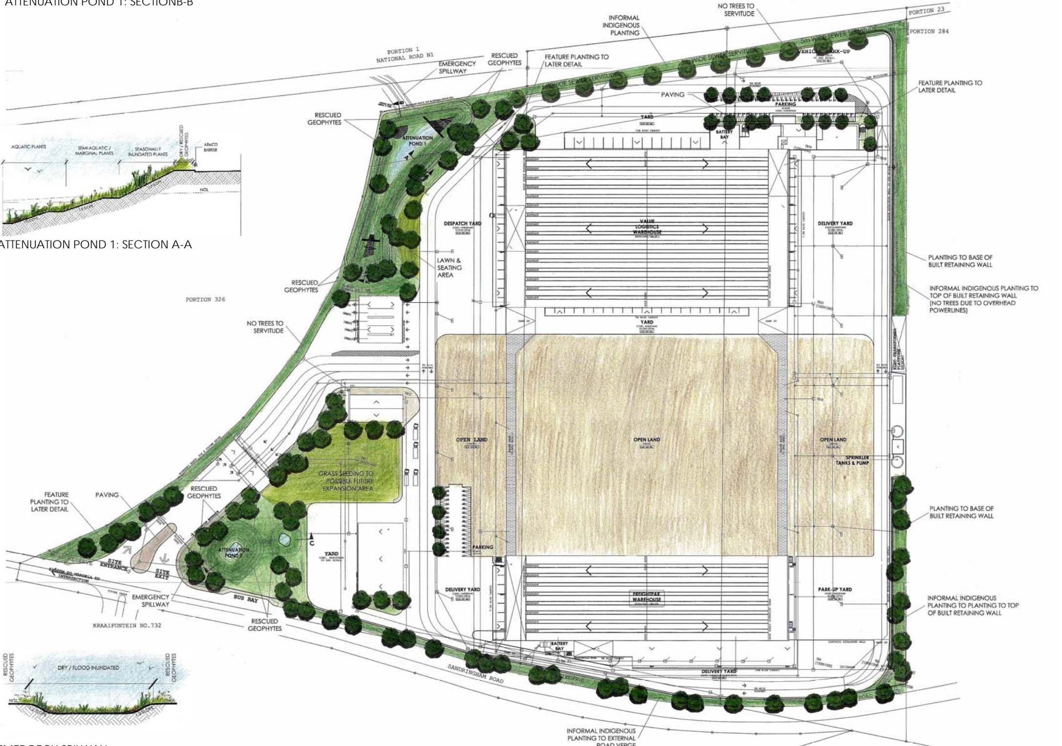
ATTENUATION POND 1: SECTION A-A