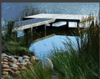
SAPOA Award, 2007

Lake Michelle Estate, Noordhoek, Cape Town