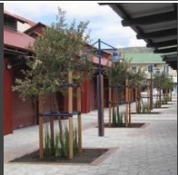
Concrete Manufacturers Award, 2010

Dube Tradeport / King Shaka International Airport Entrance Features