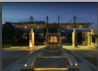
SALI Gold Award, 2008