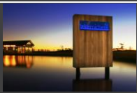
Timberframe Association Gold Award, 2008

Lake Michelle Estate, Noordhoek, Cape Town