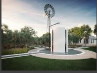
ILASA Award of Excellence, 2015 Sitari Country Estate, Cape Town