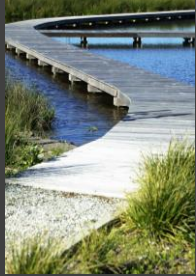
Mail & Guardian Greening the City Award, 2007

Lake Michelle Estate, Noordhoek, Cape Town